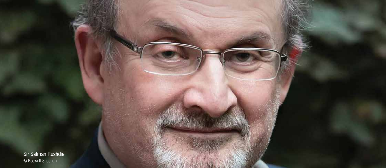
Sir Salman Rushdie