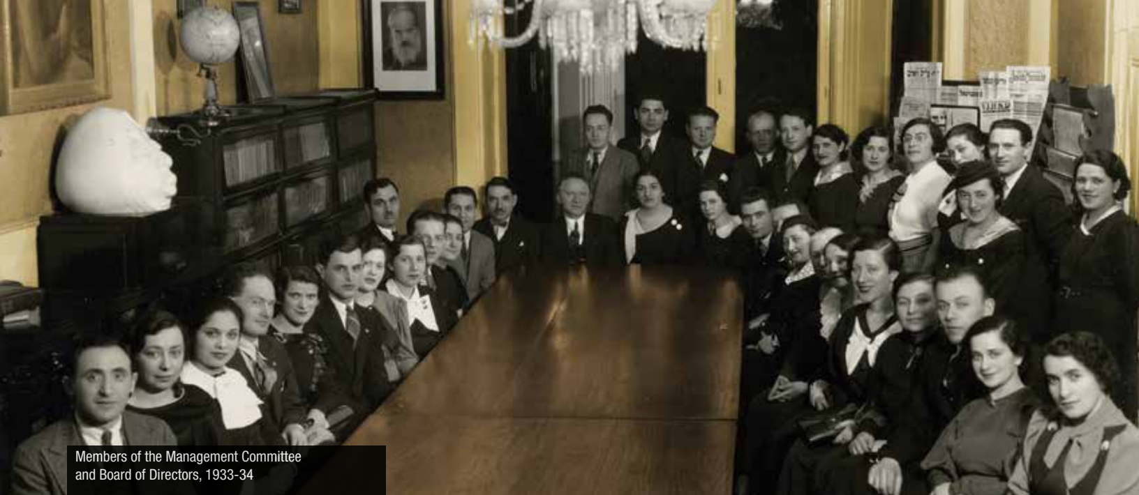
Members of the Management Committee and Board of Directors, 1933-34